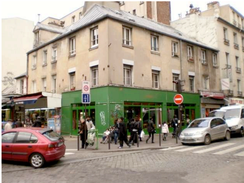
“Corner.” Joseph Heathcott (2011)