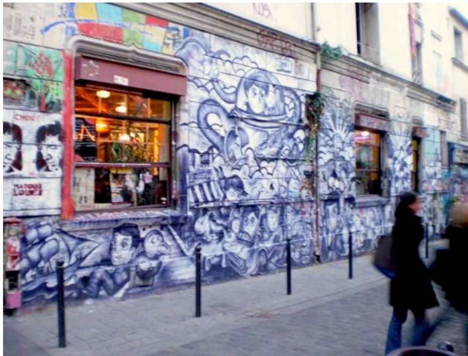
"Mural." Joseph Heathcott (2011)