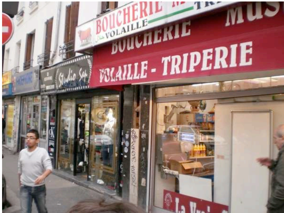
"Shops." Joseph Heathcott (2011)