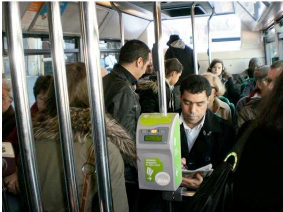
"Bus." Joseph Heathcott (2011)