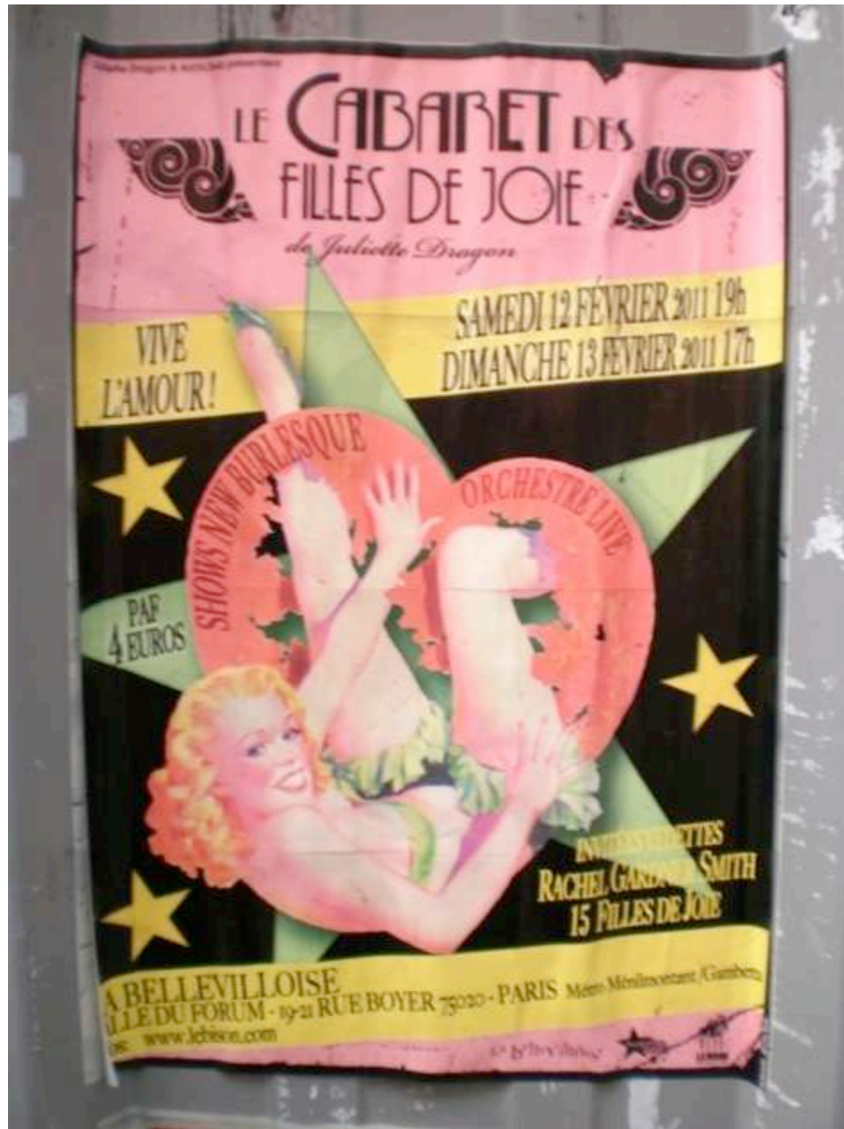
"Cabaret." Joseph Heathcott (2011)