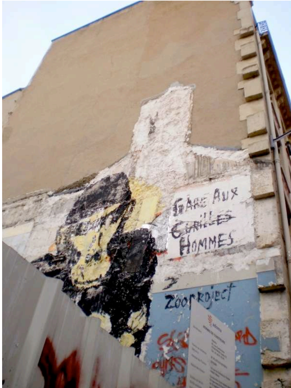
"Outline." Joseph Heathcott (2011)