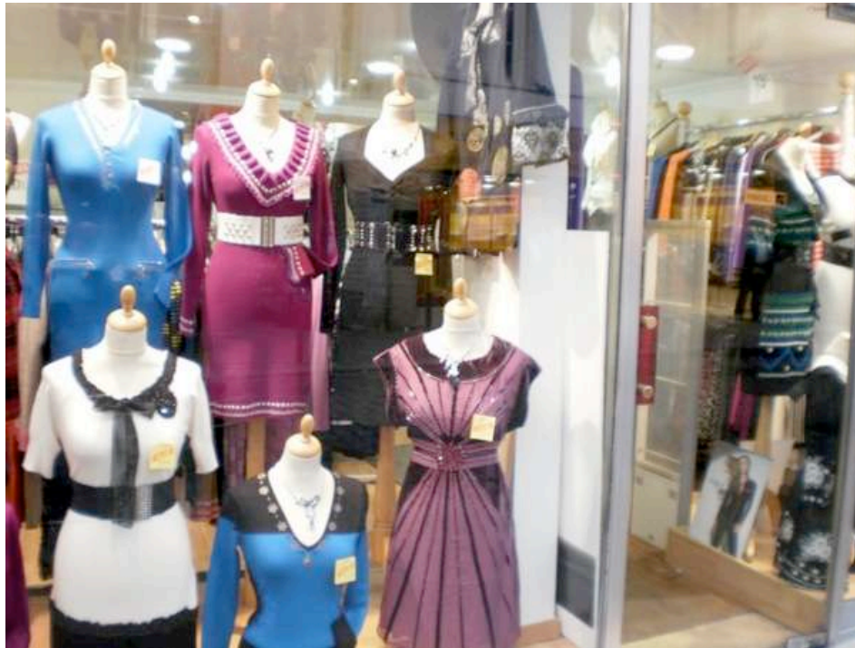
"Couture." Joseph Heathcott (2011)