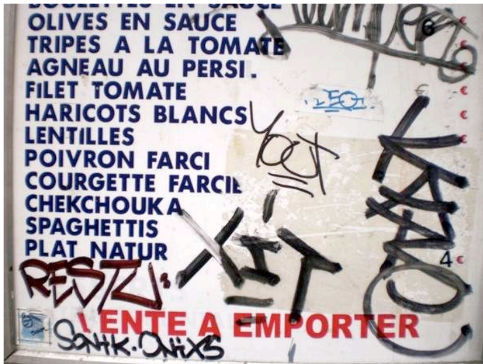
“Menu.” Joseph Heathcott (2011)