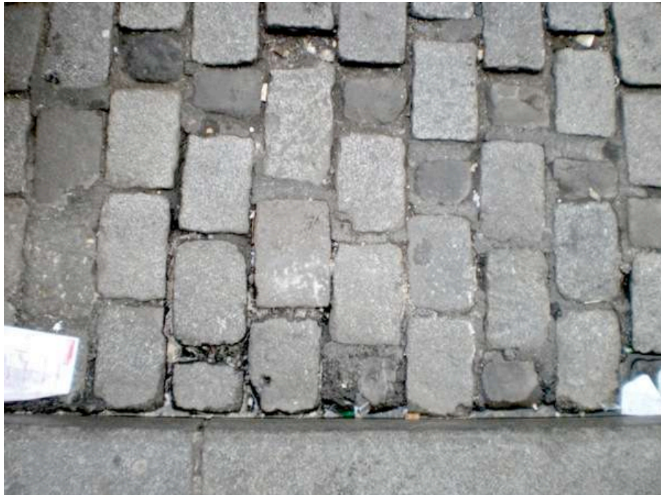
"Pavement." Joseph Heathcott (2011)