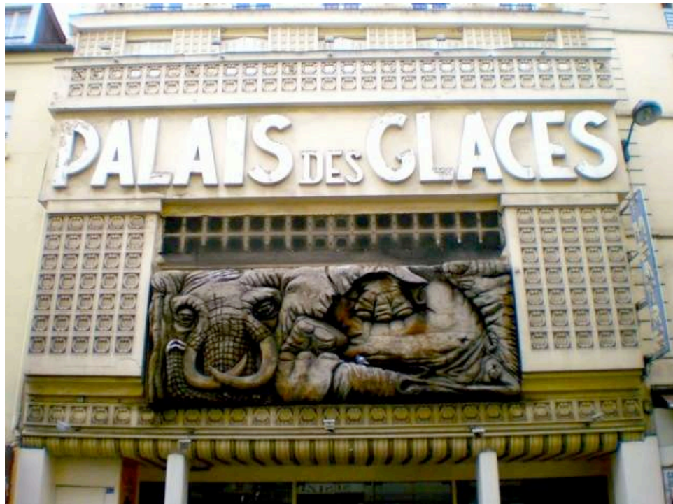
"Palais." Joseph Heathcott (2011)