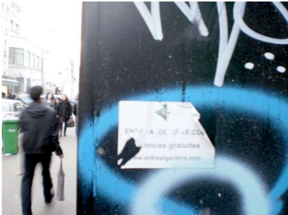
"Tags." Joseph Heathcott (2011)