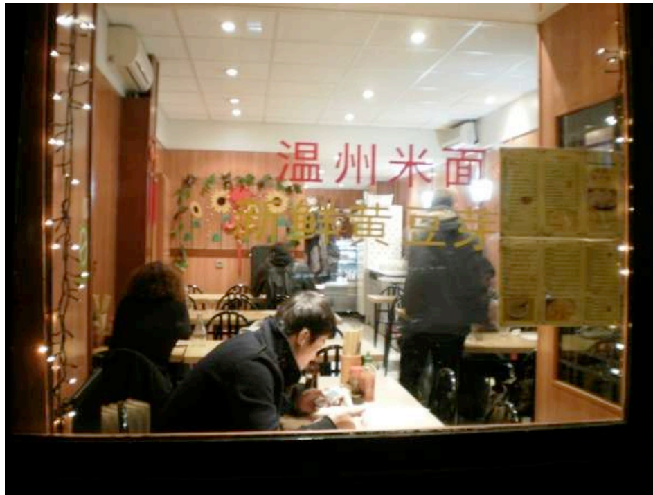
"Dumplings." Joseph Heathcott (2011)