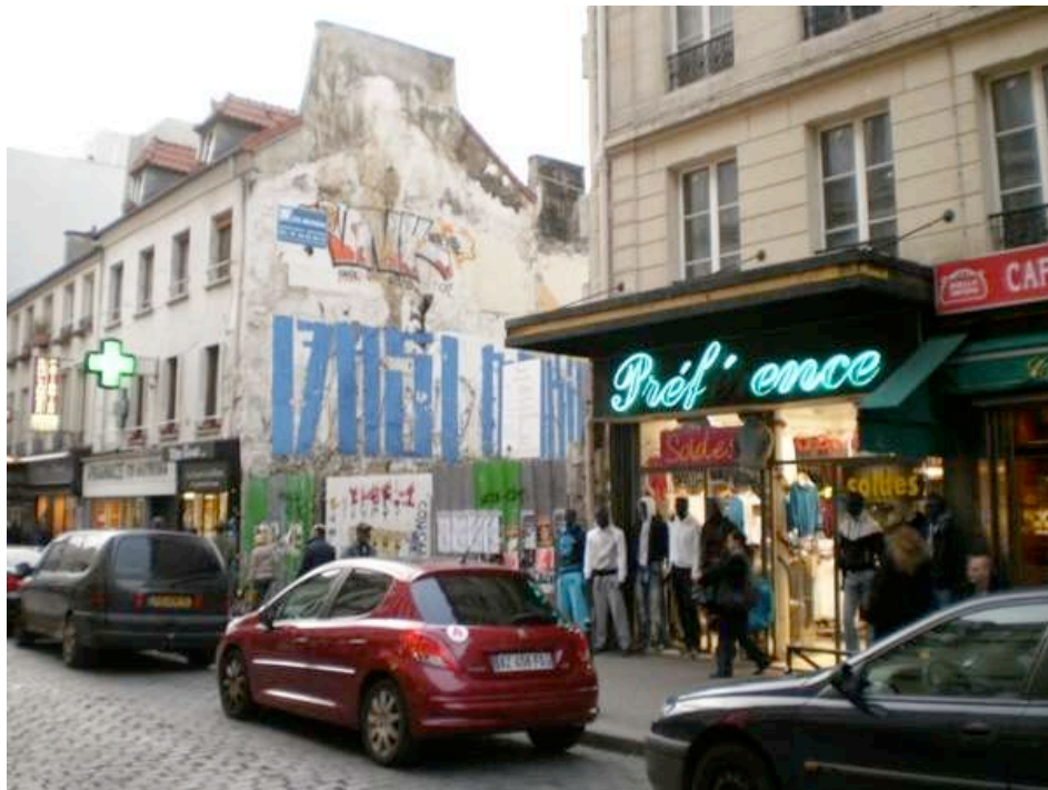
“Neon.” Joseph Heathcott (2011)