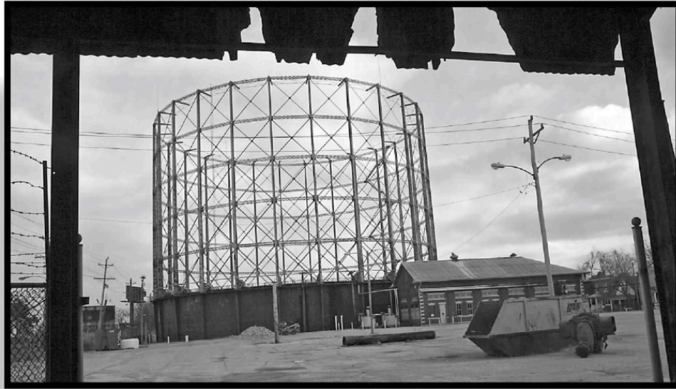
The Laclede Gas holding tank at Chouteau and Newstead Aves.